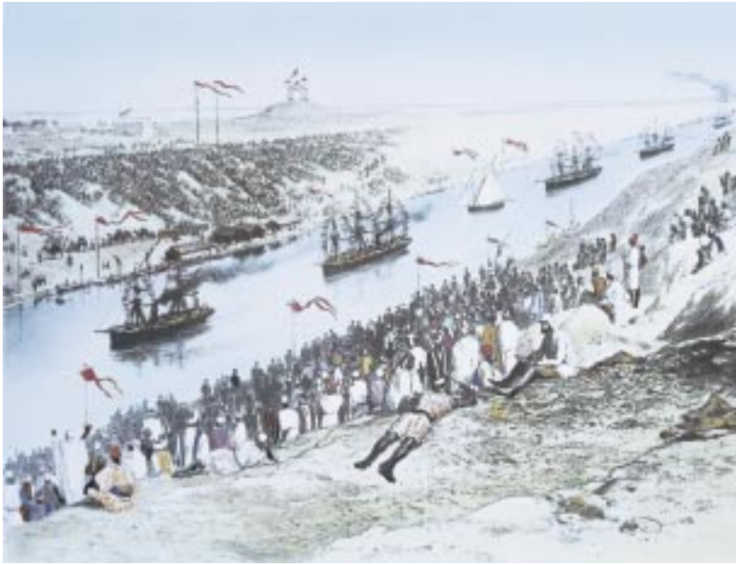
OPENING OF THE SUEZ CANAL. Between 1850 and 1871, continental Europeans built railways, bridges, and canals as part of the ever-spreading process of industrialization. A French diplomat, Ferdinand de Lesseps, was the guiding force behind the construction of the Suez Canal, which provided a link between the Mediterranean and Red Seas. Work on the canal began in 1859 and was completed ten years later. As seen here, an elaborate ceremony marked the opening of the canal. A French vessel led the first convoy of ships through the canal.

Engels, the son of a wealthy German cotton manufacturer, had worked in Britain at one of his father's factories in Manchester. There he had acquired a first-hand knowledge of what he came to call the "wage slavery" of the British working classes, which he detailed in a damning indictment of industrial life entitled The Conditions of the Working Class in England , written in 1844. Engels would contribute his knowledge of actual working conditions as well as monetary assistance to the financially strapped Marx.